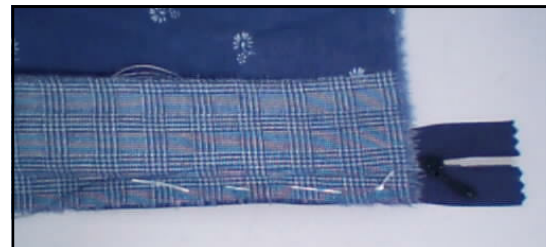
Zipper Basted to Seam Allowance