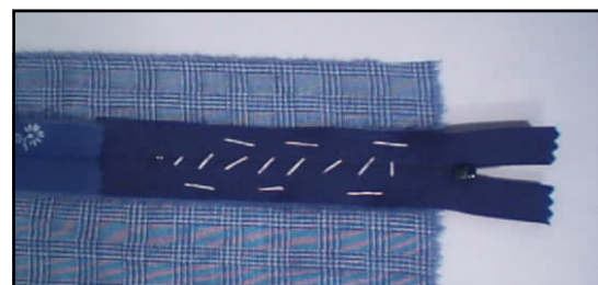
All Basting as Seen on Wrong Side